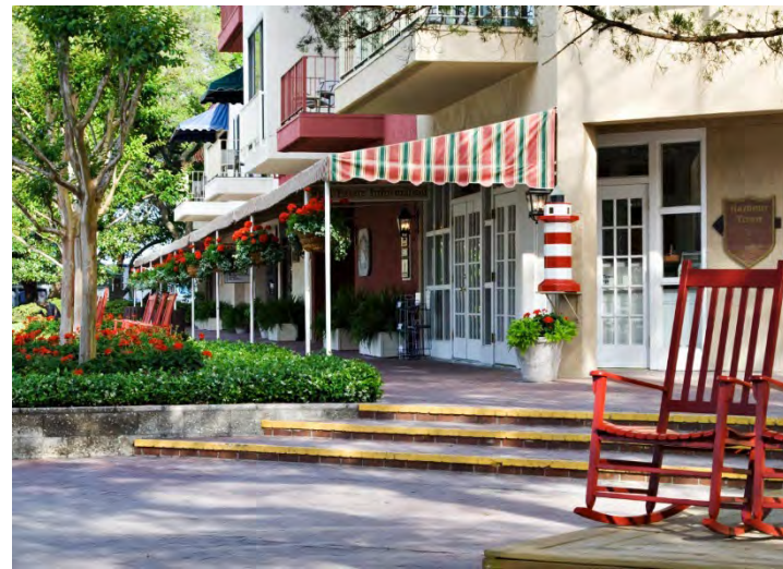
Harbortown, Hilton Head, SC