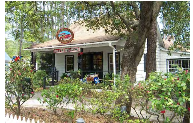
Pawleys Island, SC