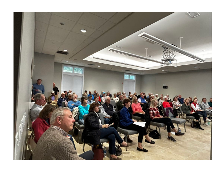
JANUARY 26, 2024

Approximately 80 people were in attendance at the Public Safety Building this past Friday as presentations were made resulting from the efforts of the Project Longevity/Community Care Committee. The Committee's goal is to make islanders aware of all the resources that are available to them and to assist them to remain on Bald Head Island as long as they wish.