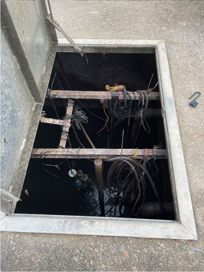
Example Pictures of a rebuilt panel-Dune Ridge Main